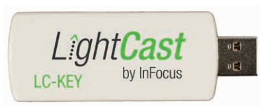
LightCast Key unlocks casting, whiteboard and browser

Command and control your IN5148HD with free ProjectorNet 4.0 software from InFocus. Projector Net allows you to remotely manage and support your projector from a single computer via your existing network.