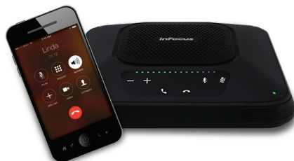
Mobile phone via Bluetooth