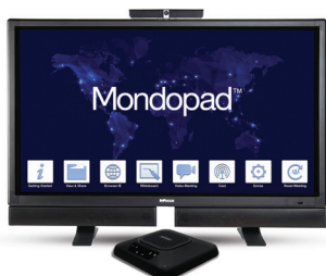
Mondopad via USB

Use Thunder with the InFocus Mondopad for clear, efficient video conferences in small-to-medium sized rooms, or in larger rooms with the optional Mic Pods. You can also use it with any other PC-based communication software (such as Skype, Lync, Jabber, etc.) to enhance audio quality and comfort. Its Bluetooth connectivity makes it easy to use with mobile devices.