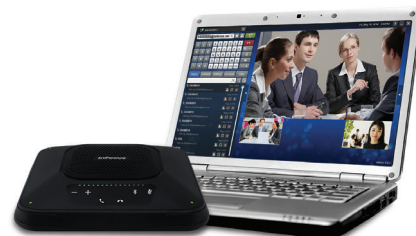
PCs via USB